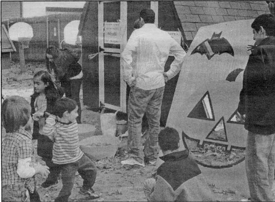
The pumpkin toss!