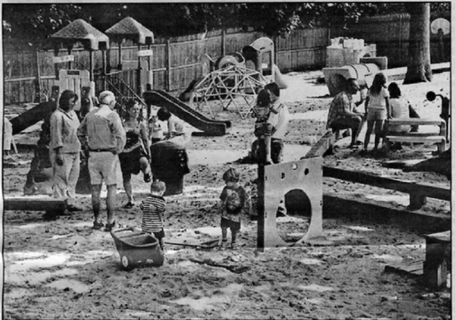
Parents mingled while their children played.